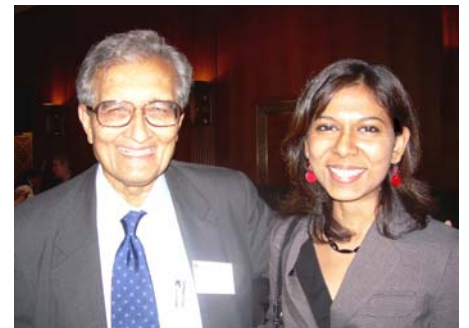
Nobel Laureate Amartya Sen and GlobalWorks' Shamarukh Mohiuddin at a Women's Edge Coalition-TASC event.