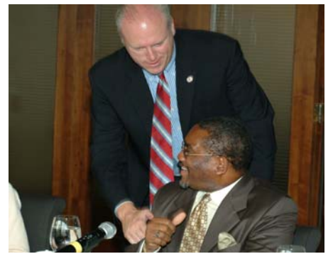
Congressman Greg Meeks with Congressman Joe Crowley at an event on trade and poverty.